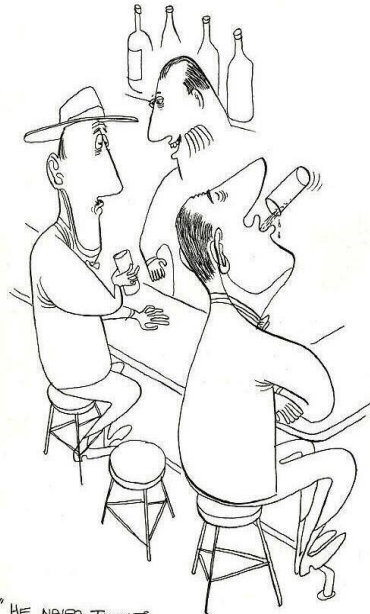
"HE NEVER TOUCHES THE STUFF."